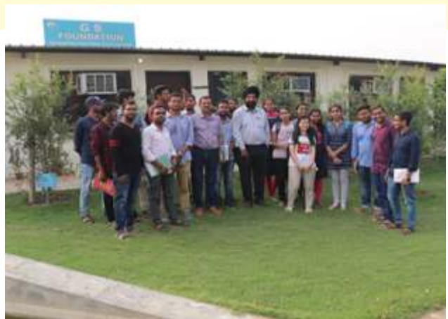
M.Sc. Dairy Economics and Sociology Students from NDRI, Karnal